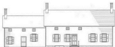
JACOBUS VANDERVEER HOUSE & MUSEUM BEDMINSTER, NEW JERSEY

Thank you for your donation to support this wonderful community tradition of hospitality, history and friendship!