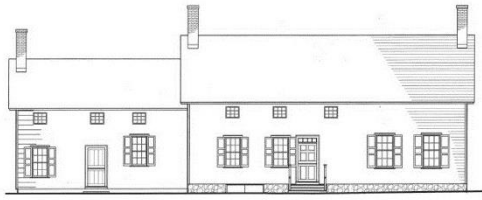
JACOBUS VANDERVEER HOUSE & MUSEUM BEDMINSTER, NEW JERSEY