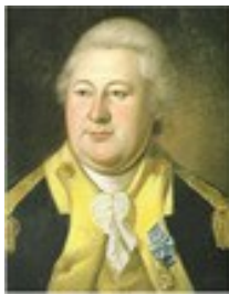
General Henry Knox